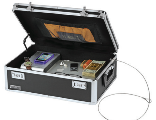
VAULTZ® Locking Storage Chest VZ00323