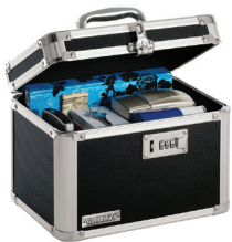
VAULTZ® Locking Personal Storage Box VZ01004