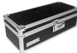
VAULTZ® Locking Pill Storage Box VZ03480