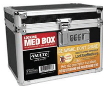
VAULTZ® Locking 4x6 Medicine Case VZ00266